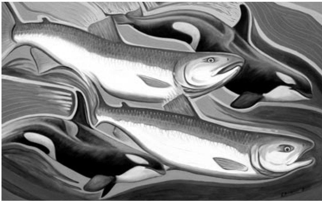
Whale Salmon by Leanne Hodges