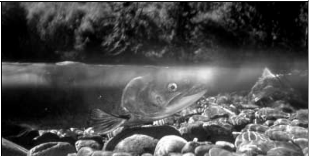
Where the Ocean Meets the Trees