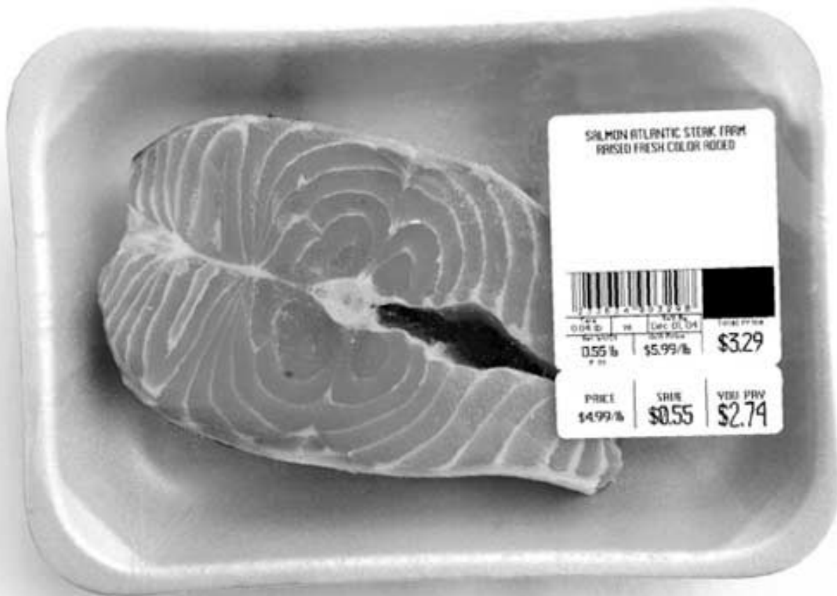
CAAR's Safeway ad.

With all the chemicals in Safeway's farmed salmon, you might as well eat the packaging.